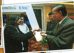
The magician who kept children of all ages spellbound